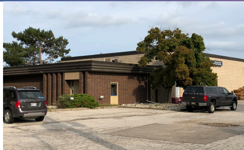
We're turning this old warehouse into the beautiful artist rendering pictured at the top of the page.

We officially took possession of the building at 2250 Speers Road in Oakville in March 2019, construction is scheduled to begin the fall, and we plan to open in mid-2020. We'll be completely transforming the building to create a state-of-the-art home for our Oakville Adult Day Program and to introduce eight short stay overnight respite beds (the only ones in Halton). Big thanks to the Warren Y. Soper Charitable Trust and all donors to the project!