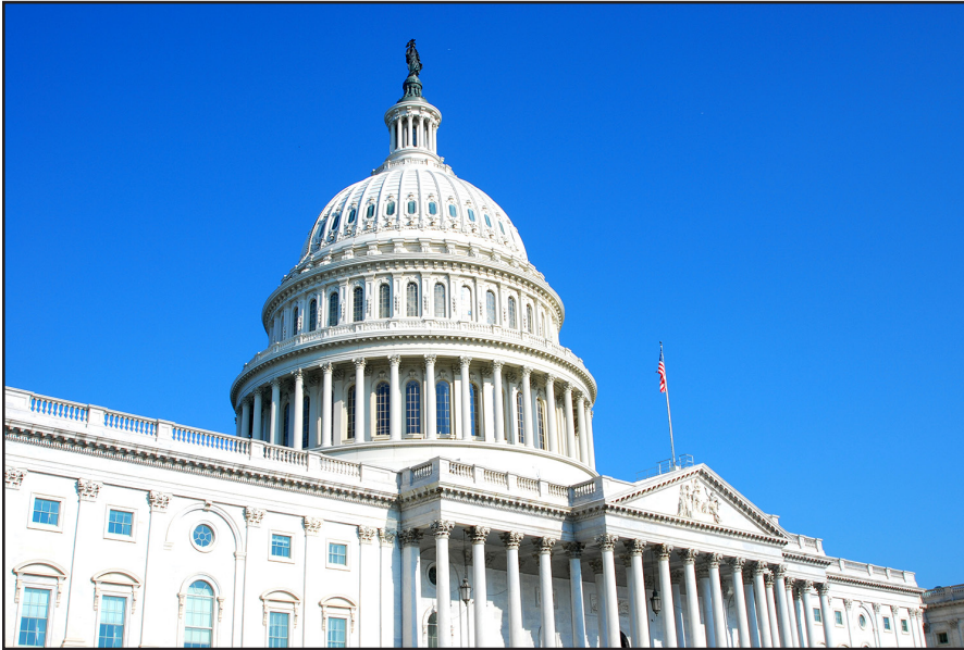
The United States Capitol