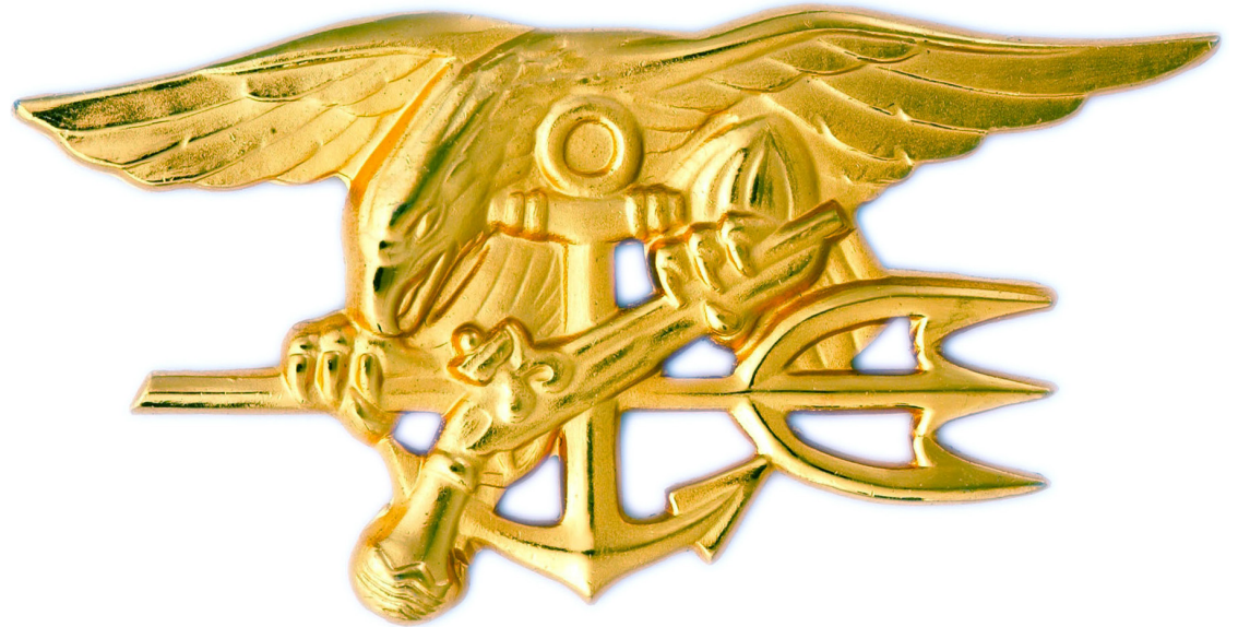
Navy SEALs Insignia