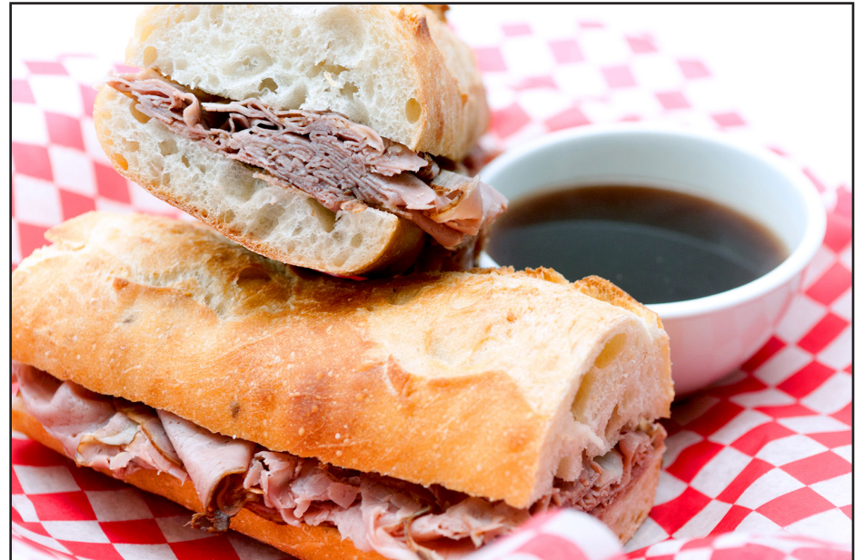
Roast Beef Sandwich with Au Jus