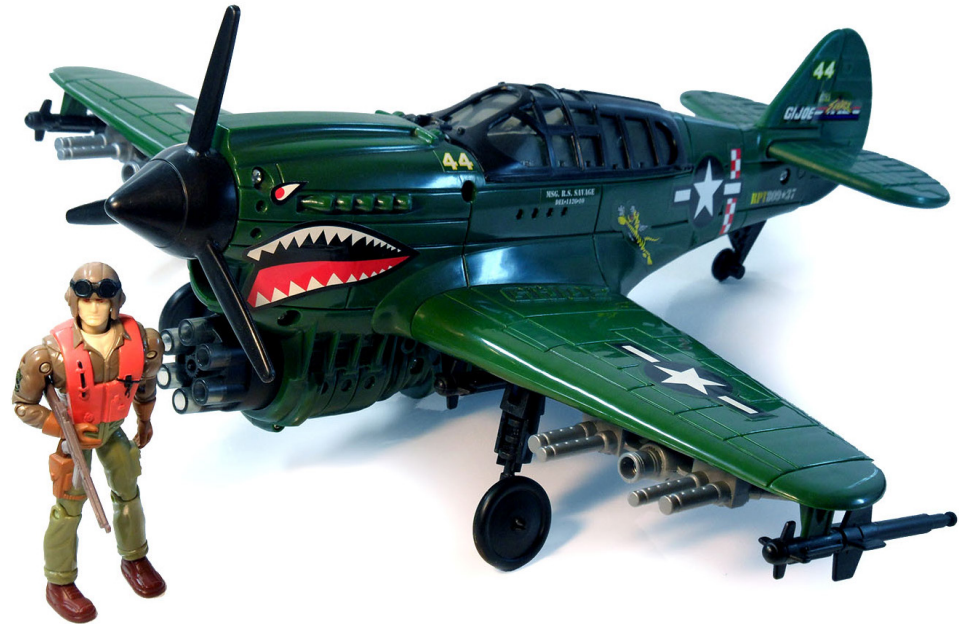
G.I. Joe Figure