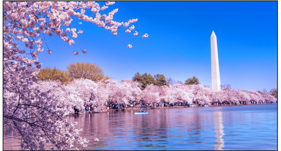
Cherry Blossom Trees