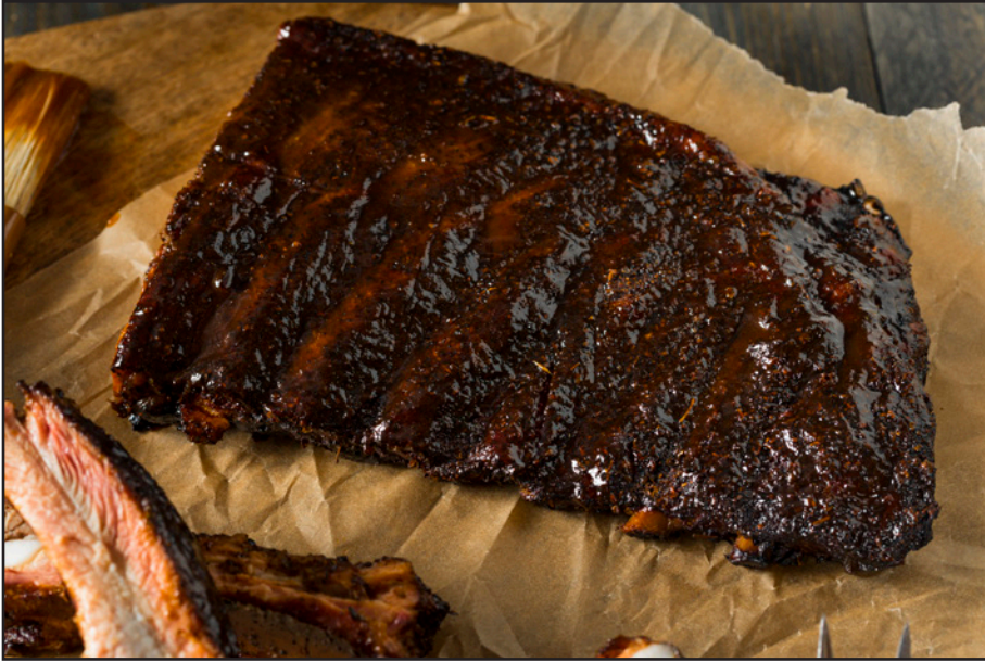
Baby back ribs