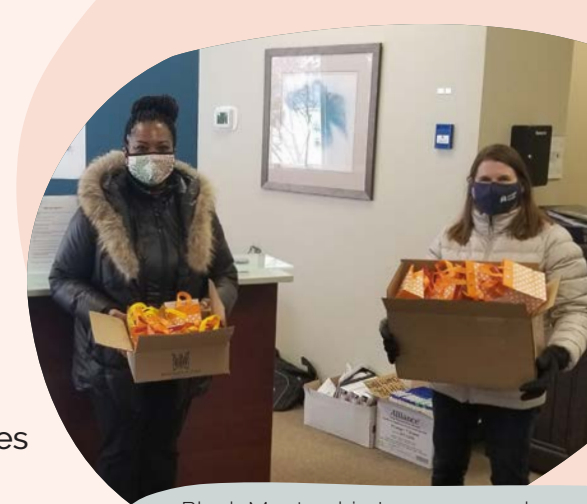
Black Mentorship Inc. generously donated gift cards for our clients.

Food insecurity snuck up on almost 150 Acclaim Health clients during the pandemic. The reasons were as varied as the families themselves: changes in financial situations, health challenges, lack of transportation or access to food, or simply not eating due to social isolation or mental health challenges. Through funding from and collaboration with a variety of community partners, we provided 217 grocery hampers and gift cards, plus 1,128 meals.