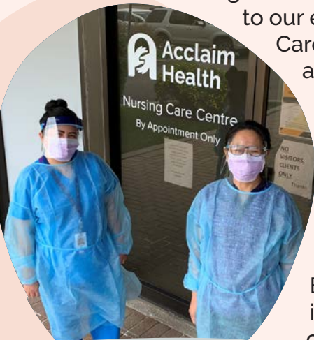
Our awesome nurses outside the new Burlington Nursing Care Centre.

...is not for the faint of heart. But when we have opportunities to better meet the needs of our community – we take them! On April 1, 2020 we merged with the S.E.N.A.C.A. Seniors Day Program, adding three Adult Day Program locations to our existing two. We expanded our Nursing Care Centre in Burlington – first by opening a temporary clinic in the downtown core to help take pressure off of the healthcare system, then by moving to a permanent, larger location to enable better physical distancing and to leave room for future growth. Lastly, we acquired CalaCare, a home care company, on December 1, 2021. Expanding these core programs means improved access to better integrated care for many of the families we help. Take that COVID-19!