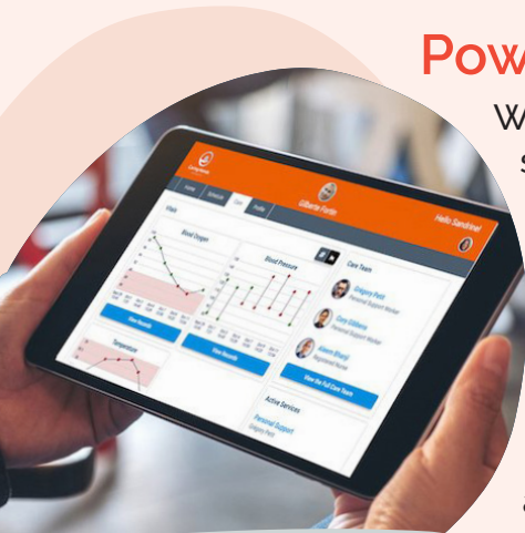
The AlayaCare Family Portal provides detailed medical information to caregivers and family members.

The pandemic has accelerated a shift to the digital world. We used virtual tools to reach more people, make care more accessible and help families better manage their care.