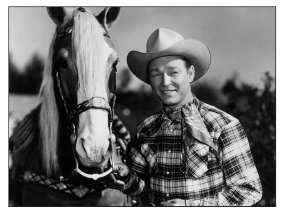
Challah Bread Trigger