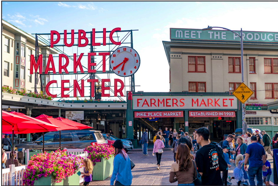
Pike Place Market