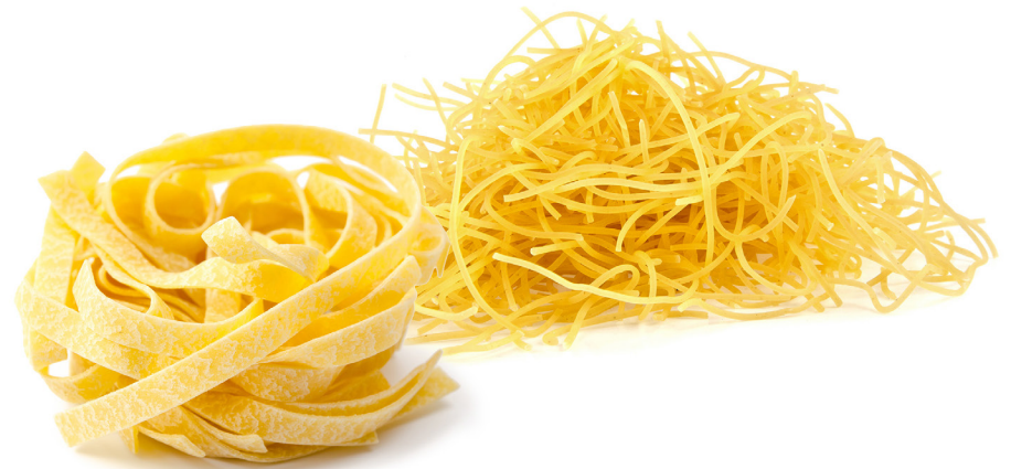
Tagliatelle and Vermicelli Pasta